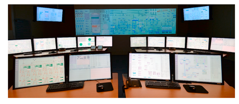
Fig. 1. The Halden Human-Machine Laboratory control room.

plant's process development (alarms, process parameters, and process events), operator process commands, navigation and interfaces accessed by the operator, a video of each operator workstation alongside an overview video of the control room, and separate audio recordings from each of the control room operators. The operator could play, pause, rewind, and forward the scenario during the performance review.