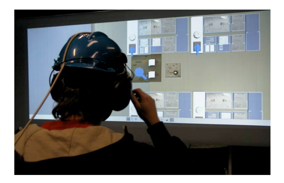
Figure 2. Operator in front of the VR model of the plant.

If the operator requested to enter a room that was not modelled, an empty room appeared on the large screen display. When entering such a room, the operators had to contact the experimental staff to tell them what operations the operator wanted to perform. The purpose of including the empty room was to avoid having to model all the rooms in the plant, but still make the entire plant available to the operators.